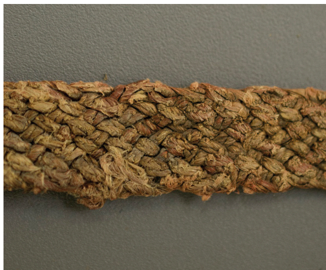
Above: Close-up of a 3,000-year old plaited band from a Menifee County rockshelter site, possibly a strap, that had been painted red with ocher. Below left: Fibers from two different plants were used to create stripes in this 2,000-year-old twined textile fragment from a Menifee County rockshelter site.

Today, we make textiles mainly from cotton and animal fiber like wool. It was not until after Europeans arrived that Kentucky's Native peoples used those fibers in textile production.