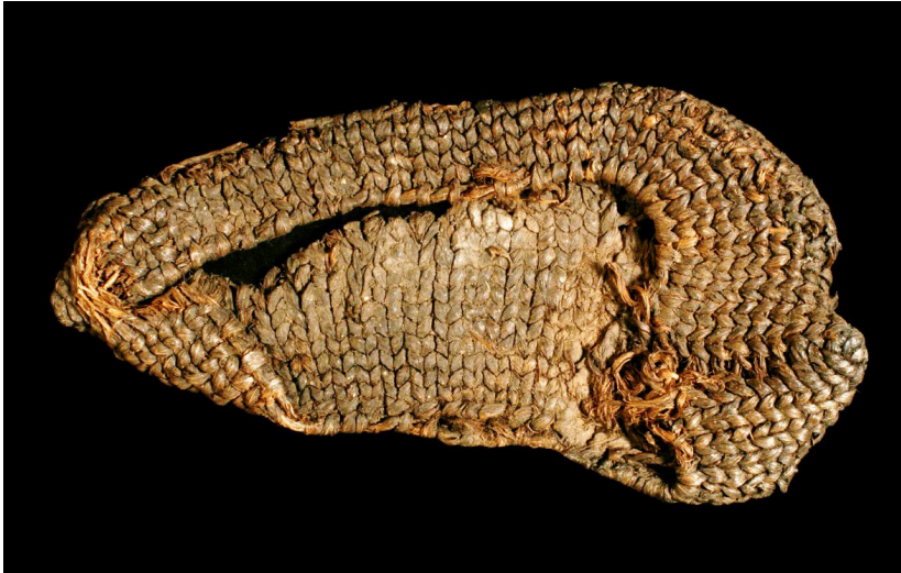
Slippers were the perfect footwear for exploring Kentucky's caves and rockshelters. This 2,500-year-old slipper is from a site in Edmonson County.

The textiles Native peoples made and used tell us a lot about who they were and what they did. We know some were cavers because we find their tightly twined slippers deep in caves. They carried heavy loads in large sacks that they reused over and over again, as revealed by the many mended spots.